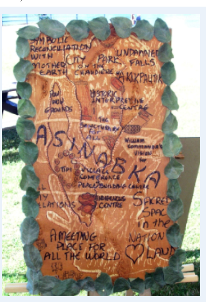
The Vision for Asinabka / Victoria Island

the diplomatic corps, environmentalists, peace activists, writers, musicians and artists, the Chief and Deputy Chief of Police from the City of Ottawa and representatives of the Royal Canadian Mounted Police, Ontario Provincial Police and Surete du Quebec: ordinary folk and extraordinary folk.